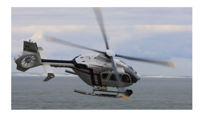
Human safety and environmental hazards can quickly escalate in offshore production with unwarranted trips to and from site. Gaining remote visibility to these sites is exceptional to delivering strong sustainable, return.

Once Enovate Ai had a crystal clear vision of what was already in use, what was needed, and what was not needed, they worked with Emerson